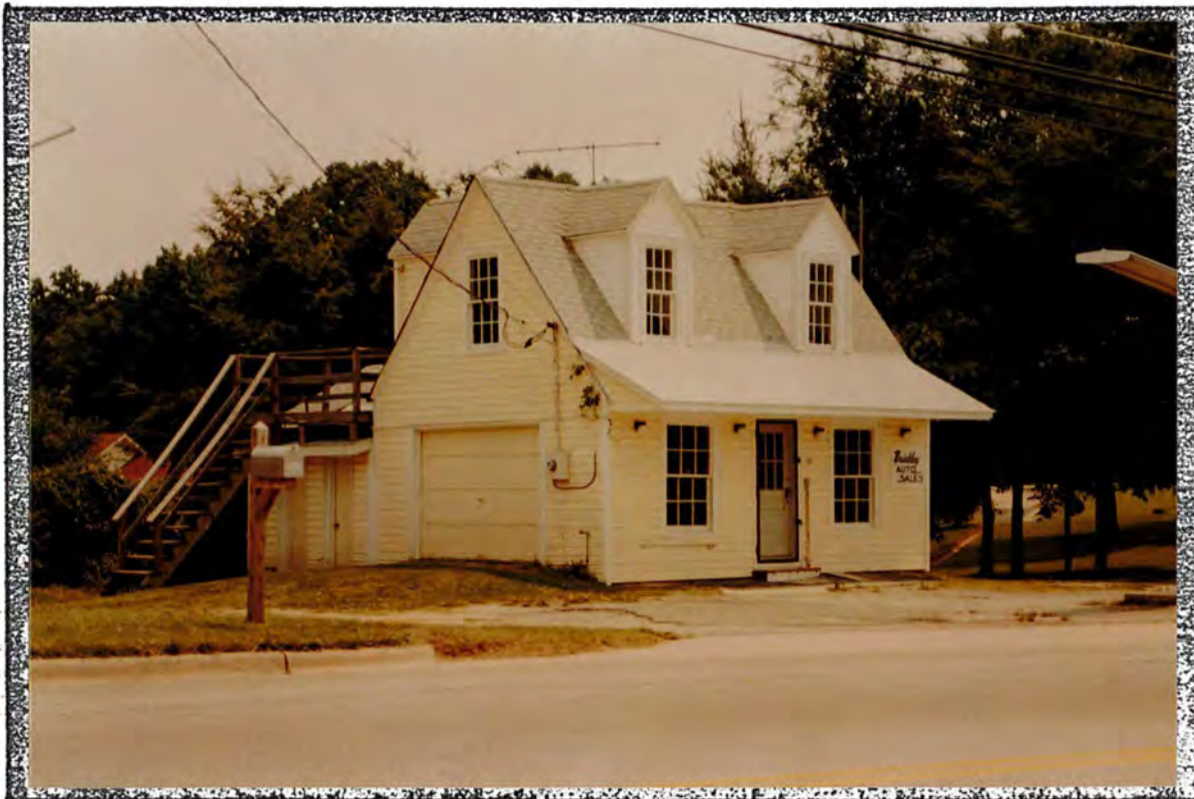
6. Gas Station